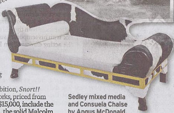
Sedley mixed media and Consuela Chaise by Angus McDonald.

bull in furniture". But to paint beautiful animals then to feature their hide on objects?